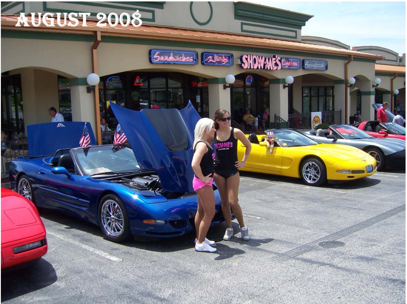
Car Show at Show-Me's