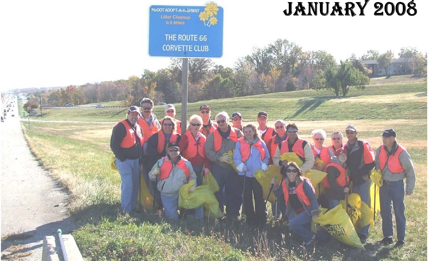
Trash Pick-up - Fall 2007