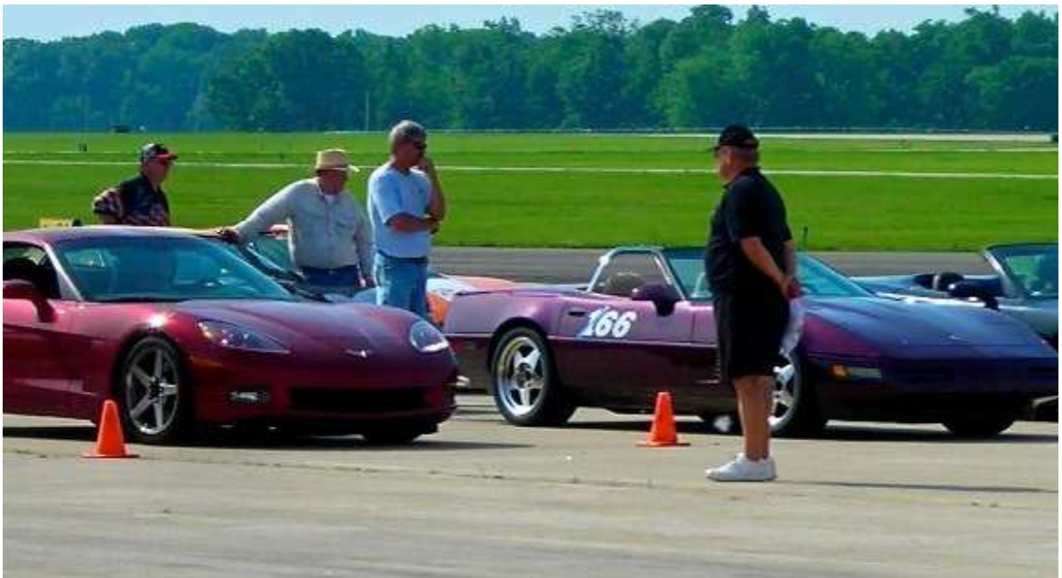
Autocross at Mattoon, IL