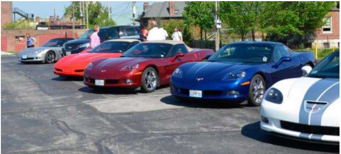
Parking for the Fox Theater Tour