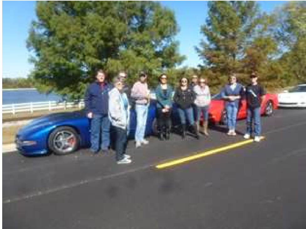
Fall Tour Road Run