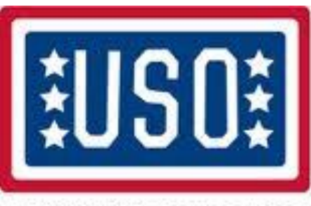
Until Every One Comes Home*