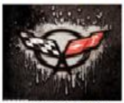
Food and apirits