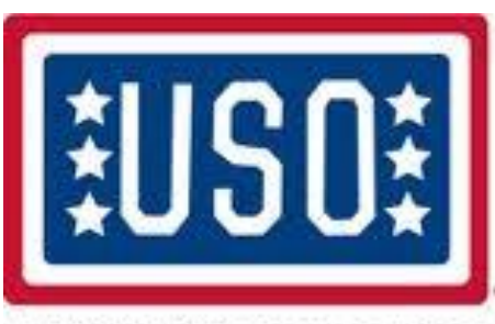
Until Every One Comes Home*