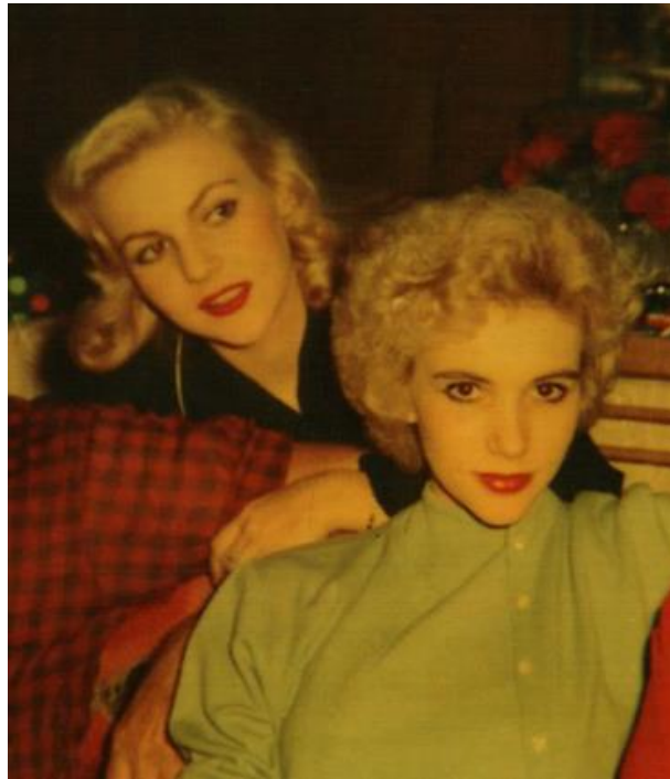
The Corvette Twins

Rumor spread quickly in school about the car and the occupants as it was hard to believe two such beautiful girls could exist and that they were sisters and drove the fabled and yet unseen and newly developed Corvette was something that could not be believed. But to the dismay of many of the girls, and to the delight of the boys, the car and girls did exist and what a sight it was to see such a rare car as there were none in Mississippi or Texas. After all,