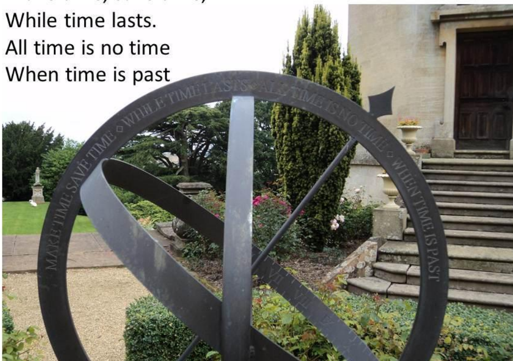
Words on a sculpture in the garden at Harlaxton College, UK.

Make time, save time, While time lasts. All time is no time When time is past