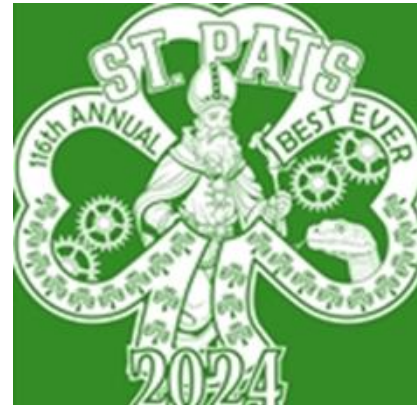
Green Missouri S&T St. Pat's Crew 2024 Neck Sweatshirt