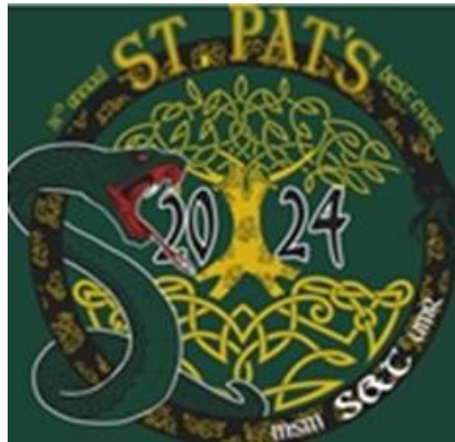
Green Missouri S&T St. Pat's 2024 Crew Neck Sweatshirt