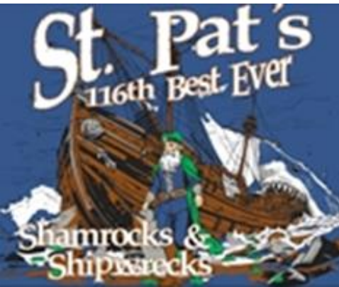
Blue Missouri S&T St. Pat's 2024 Hooded Sweatshirt Shamrocks & Shipwrecks