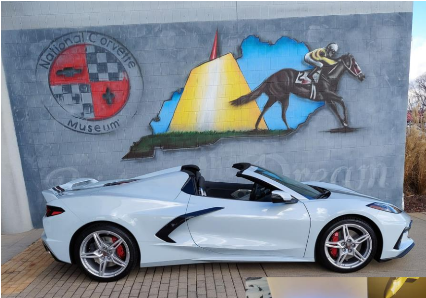
At the Exit from the Museum

Hard Top Convertible (HTC), Ceramic Matrix Grey